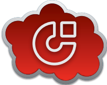
Cast Iron Cloud™

The Cast Iron Cloud for salesforce.com is our integration-as-a-service solution. Using a "develop once, deploy anywhere" approach, the Cast Iron Cloud is ideally suited for salesforce.com customers with a majority of their applications based in the Cloud and want no infrastructure on premise.